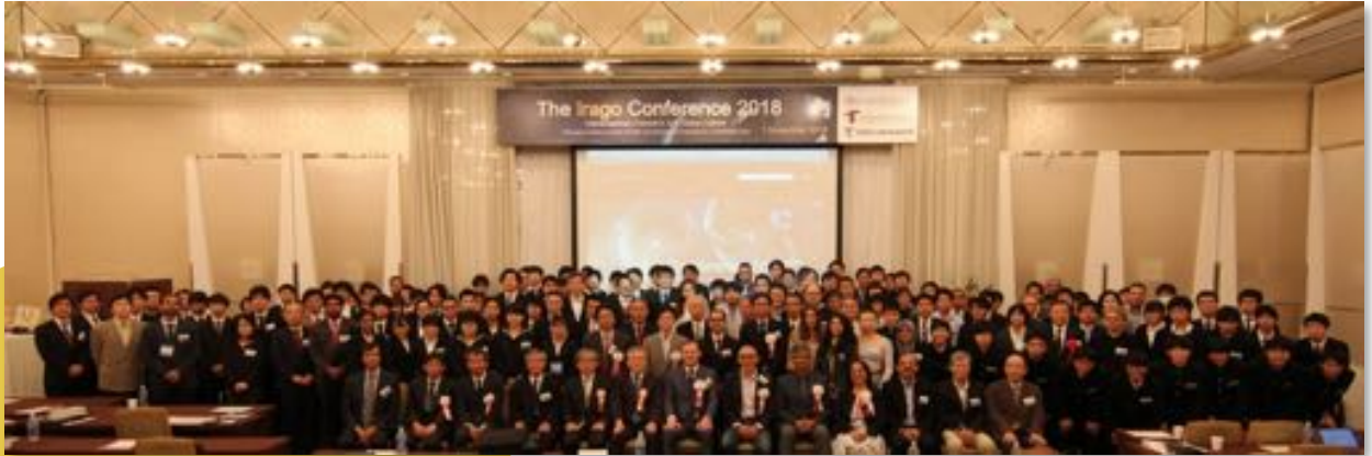
Conference photo of the Irago Conference 2018 in Shinjuku, Tokyo

The objective of this conference is to provide an 'interdisciplinary-platform' to enhance mutual understanding between scientists, engineers, policy makers, and experts from a wide spectrum of pure and applied sciences in order to resolve the daunting global issues facing mankind. In particular, the organizers would like to encourage graduate school students to participate and talk directly with internationally renowned academics, industrialists, and opinion leaders for a firsthand view of the major issues facing scientists and engineers of the 21st century.